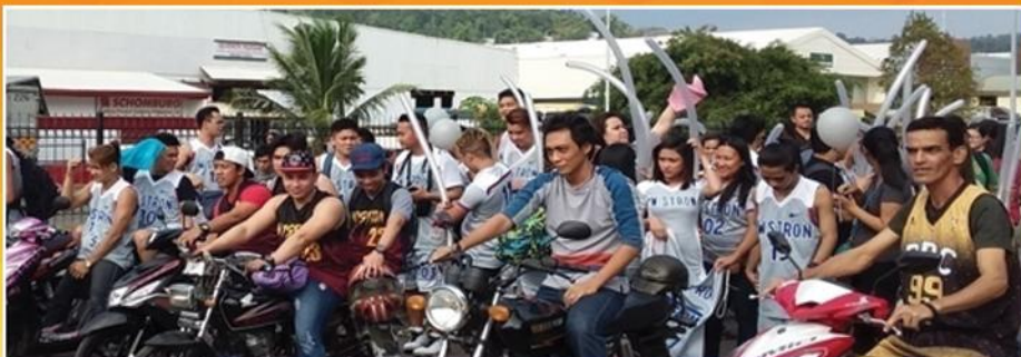
Employees ride their motorcycles at the start of the parade.