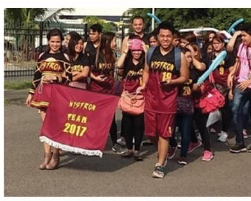
CPS300/CPS500 Maroon Team