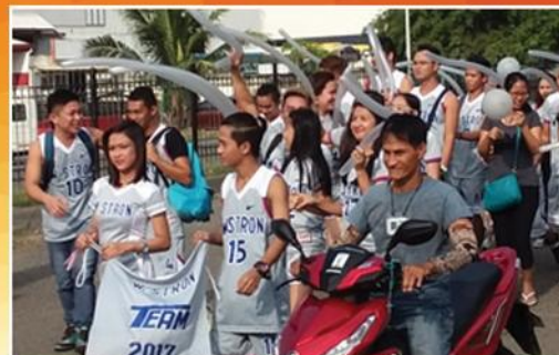
CPS200: Material Operations Department Gray Team