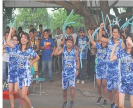
BEST IN CALL OUT CHEER CPS100: Repair Department BLUE TEAM