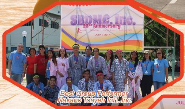
Best Group Performer Nakano Tonyeh Intl. Inc.