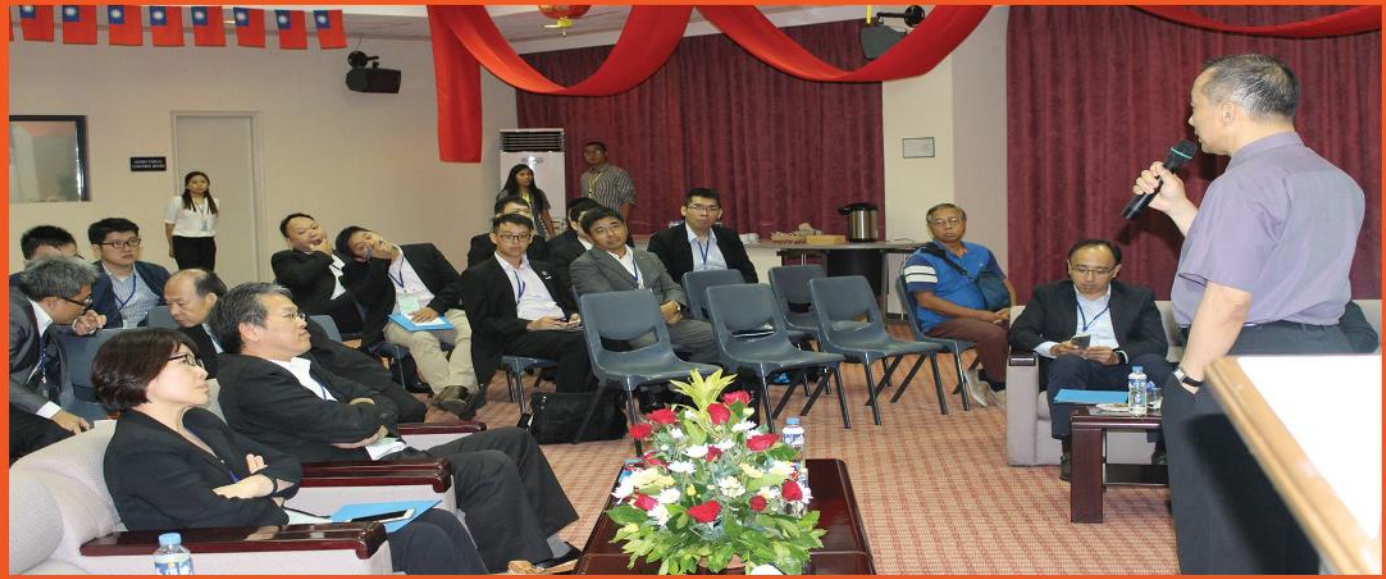
Taiwan Industrial Delegation July 24, 2017