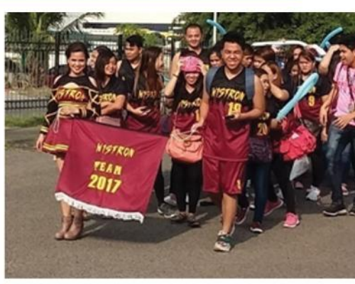
CPS300/CPS500 Maroon Team