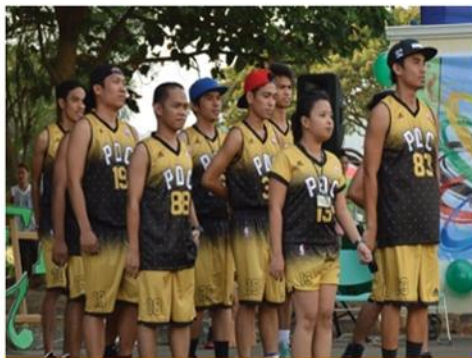
BEST IN UNIFORM MBL500: PCB Design Center Black Team