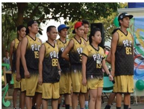
BEST IN UNIFORM MBL500: PCB Design Center Black Team