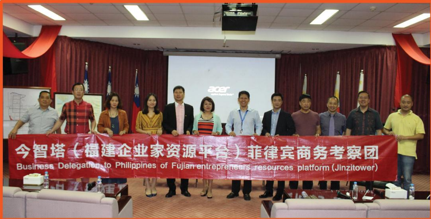
Business Delegation to Philippines January 10, 2017