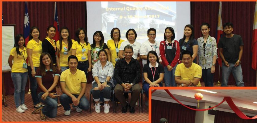
ISO Training for Managers and Internal Quality Auditors March 8-10, 2017 ISO 9001:2015 Quality Management System Course ISO 9001:2015 Internal Quality Audit (IQA)