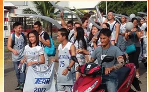
CPS200: Material Operations Department Gray Team