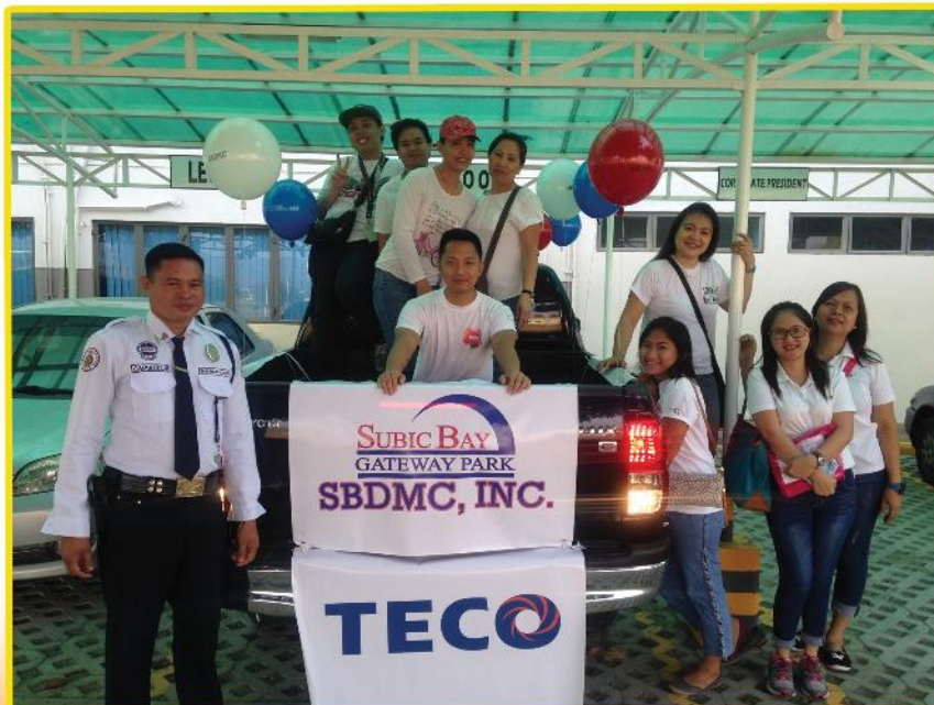
Labor Day Parade (SBDMC and TECO 3C employees) May 1, 2017