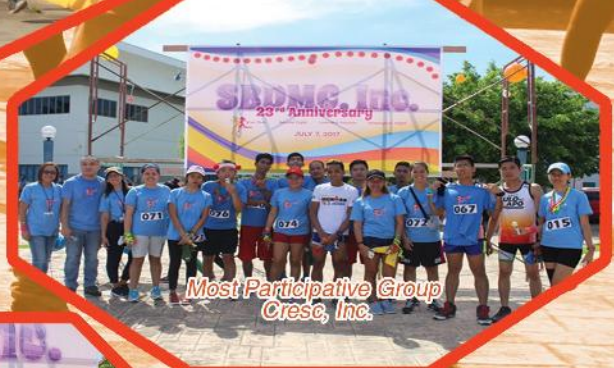
Most Participative Group Cresco, Inc.