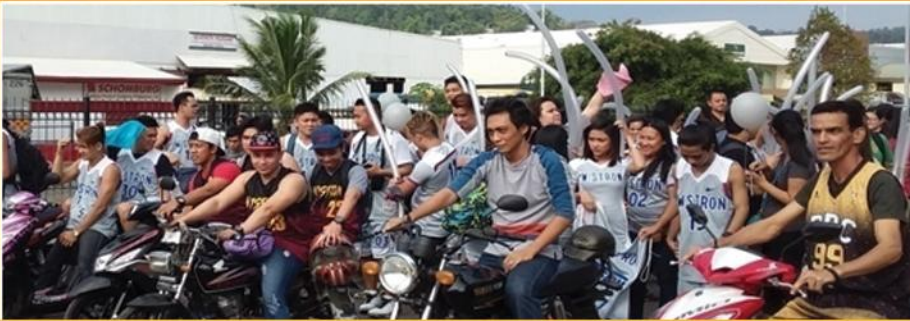
Employees ride their motorcycles at the start of the parade.