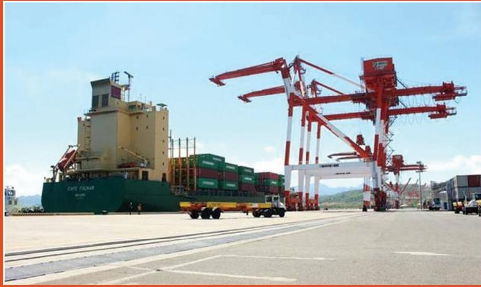
The MV Cape Fulmar, docked at the New Container Terminal-2, positions itself near the huge gantry cranes on Wednesday to unload container vans in Subic Bay Freeport. The port call made by the ship is the first, marking the start of the Kaohsiung-Subic- Kaohsiung route for Evergreen Lines, the world's 5th biggest shipping line.

Subic Bay Freeport is now the port of call of global shipping company Evergreen Line, a shipping line based in Taoyuan City in Taiwan, after delivering its container vans on Wednesday, April 21, aboard the 1,440-TEU vessel MV Cape Fulmar.