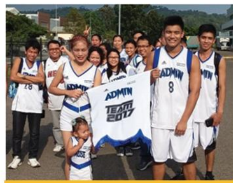
Administration Department White Team