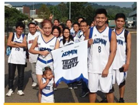
Administration Department White Team