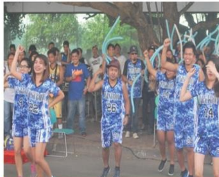
BEST IN CALL OUT CHEER CPS100: Repair Department BLUE TEAM